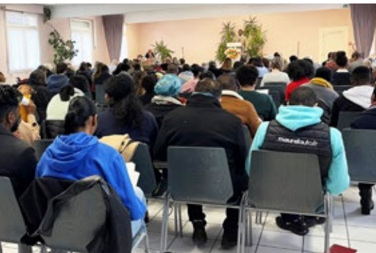
Mission Foi Evangile - The last inter-church meeting in Olivet on the 16 March 2025